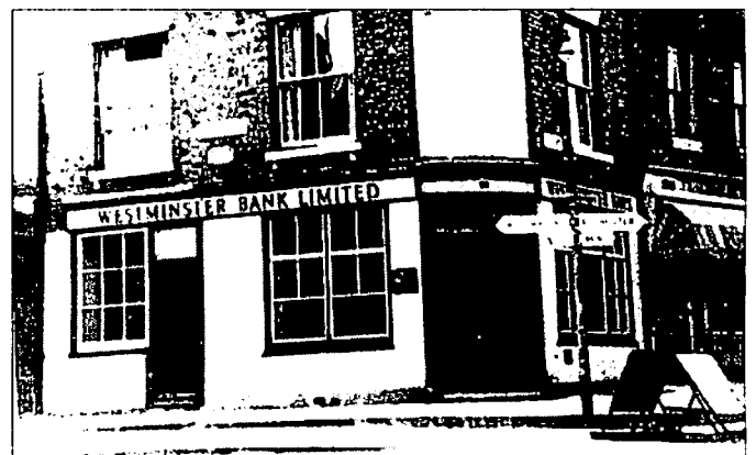
Wyndham House, so called because the first resident came from Wymondham in Norfolk

Another project in which all members can assist is to record the extant house and terrace names around the parish. There have been several changes to numbering and names over the years. In earlier times (as shown in the censuses) houses were known by name more than by number. Some were even called after the people who built or lived in them. It often remains difficult for people tracing their family history to be able to decide confidently where their ancestors lived, so the more information we can gather the easier will such searches become.