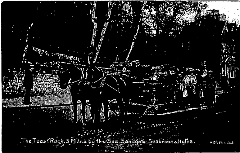
Numbered 123, this is an early postcard of Hambrook Brothers ('HB's), in conjunction with the as yet unidentified firm of 'F&L'.