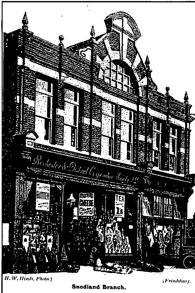
The Co-operative Stores in Holborough Road, photographed in the year the shop opened: 1904-1905

The opening of the new Co-operative Store